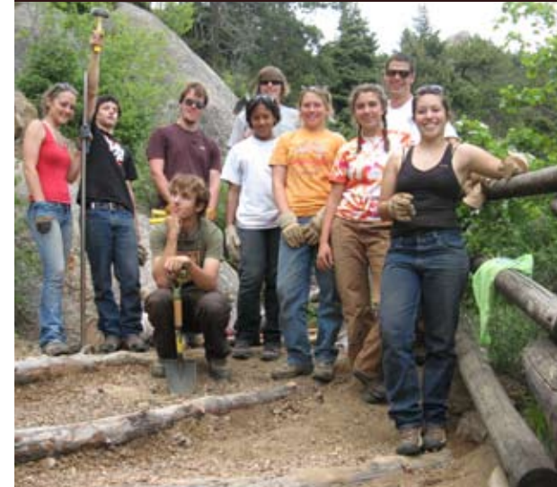
Pikes Peak Corps 2009 on Barr Trail after a hard day's work.

2009 saw the launch of a new educational program, Pikes Peak Corps. Based on the same philosophy as our highly popular undergraduate Earth Corps program, Pikes Peak Corps is an environmental stewardship and education program for local high school students. The inaugural year of this program was met with much success. We received 35 applications to fill 10 spots. Participants represented public, private, and charter high schools. The 23-day program introduced students to ecosystem restoration and trail building, while incorporating an environmental education curriculum that focused on geology, geomorphology, alpine botany, hydrology, and GPS. While expanding their understanding of ecosystem science, students learned key technical skills to complete trail and restoration work. The program was run in a variety of locations within the Pikes Peak region including Garden of the Gods, Fountain Creek and Pikes Peak. 2010 will see a significant expansion of this program. The University of Colorado at Colorado Springs is now partnering with RMFI and expanding the educational component of Pikes Peak Corps. Upon successful completion of the program students will earn 4 credit hours from UCCS in GES 101: Environmental Systems—Landforms. This is a core class with transferable credit. The program will also be expanded to 8 weeks in 2010.